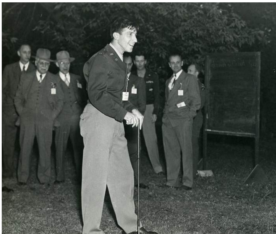
Photo: Y's Men's Group at Carlisle Barracks, 1947.