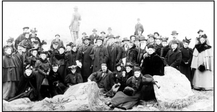
A visit to the Gettysburg battlefield.

Our photo exhibit for 2013 in the museum photo gallery featured "Cumberland County Faces of the Civil War." Many of our images were used in the main Civil War exhibit and we helped with the creation of the ten Civil War videos made by Dickinson College students to accompany the exhibit. In the hall outside the Photo Archives, we had a cased exhibit about Civil War photography, and on the photo boards on the wall we had a general "Cumberland County in the Civil War" exhibit. For the holiday season the hall exhibits featured photos of Christmas trees, model railroads and train postcards. Thank you to all our volunteers for helping in the photo archives room and for all who donated images in 2013!