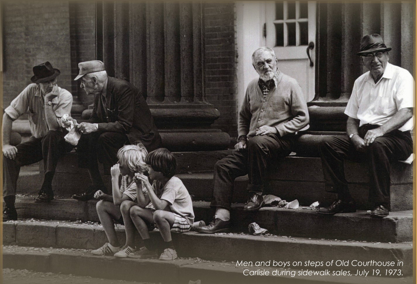
Men and boys on steps of Old Courthouse in Carlisle during sidewalk sales, July 19, 1973.